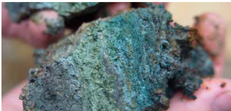
New Kimberlite Discovery at Riihivaara