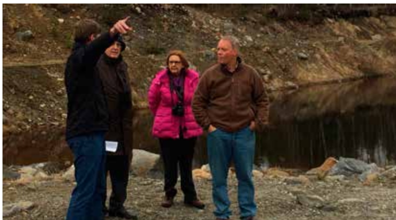
On Site in Finland